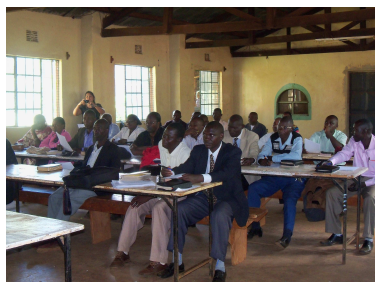
Church Planting in progress-Thika