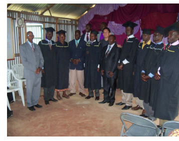
Kisumu GPT Graduation Ceremony