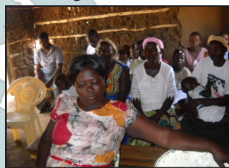
Rabour worship Service