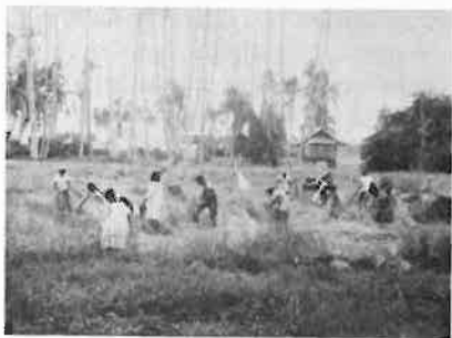
The first rice harvest at the IGBI

TRAINING: The goal of the International Grace Bible Institute is to train young people of the Philippine Islands and the Far East in the Bible, the Lord Jesus Christ, and the Gospel of the Grace of God as revealed to the Apostle Paul. After this training they will go out into the harvest field of souls. The students not only get a knowledge of the Word of God; but also training in practical things such as rice planting the modern way, gardening, raising chickens, pigs, etc. Many will have to go back and work and preach in order to build congregations that can support a pastor full time. The training at the IGBI will help them to know how to get the most from their land. The Apostle Paul worked and preached (Acts 18). We are to follow him as he followed Christ (I Cor. 11:1).