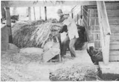
Hand labor, yet the Lord supplied twenty sacks of rice

dents. While talking about rice we received $500.00 last week from a dear saint in the States to buy rice land. We do praise the Lord as this has been a matter of prayer for some time. We will buy undeveloped land and make it into rice land. This will be cheaper, but more work. This land also joins what we already have, making it nicer for the school. Pray for us that we may get this land ready for the next planting. If we can plant this new land at the next planting this will take care of a great expense of the school. We have been trying to build up our livestock also. But because of finances we are not able to expand. We are praying that God will supply this need also. Will you pray with us? Maybe there will be some groups that would like to take as a project the purchase of some livestock for the IGBI. If you are interested in this, write us and we will be glad to give you more information. If we can get the riceland developed and the livestock growing, it will be only a few years before the school will be self supporting.