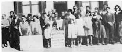
Congregation at Vista-Linda, Uruguay

I have heard from some of the groups that I ministered to while on my last trip to Uruguay, Bolivia, and Northern Argentina. These groups are interested to know more of the Word of God and are asking that I return some time to minister to them again. I am enclosing a picture of one of the congregations that I ministered to while in Uru-