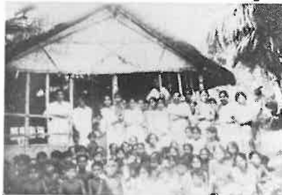
T.C.M. Gospel shed and congregation of the Grace Church in Alleppey, India

The work in this section of India is going along well and we are holding services in both of our chapels.