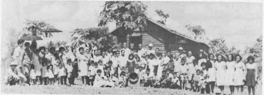
The congregation at Maramag which has recently become affiliated with T.C.M. Other groups are calling for help but there are no evangelists to send.

istry. All but five of these young people will be leaving the Bible Institute this year due to graduation or internship. The Lord has blessed their ministry where ever they have presented the Gospel in song or by testimony.