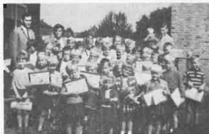
Group of V.B.S. students in Eerbeek, Holland.