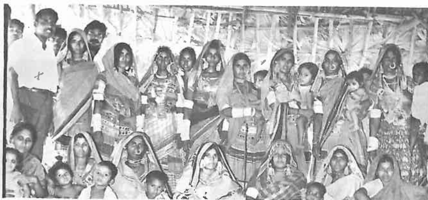
These nationals are anxious to hear the Word. "I preached here the salvation which is in Christ Jesus."