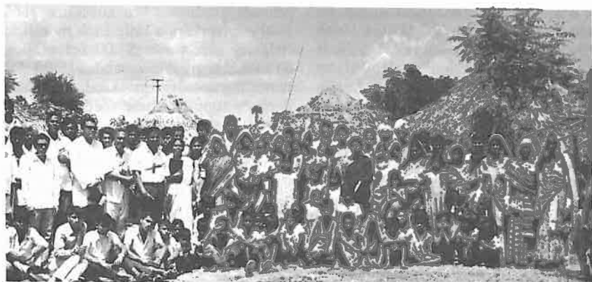
More than two hundred witnessed the Word at this meeting. "Many have left the after meeting... this picture is of the remaining people (nationals)."