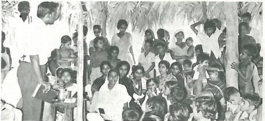
These people are called "LAMBADIS." "I have been working among these people and this is the first time they heard about Jesus Christ."