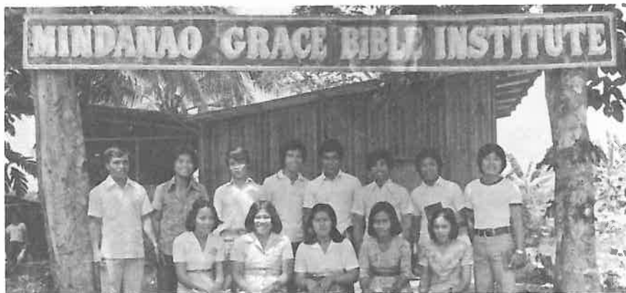
Present 2nd and 3rd year students. Background—Kitchen, dormitory and classroom space.

the best possible methods, the best possible teaching and training that can be done. They have a big responsibility to see that the students are prepared for the work as they go out to minister to people for the Lord. There is always the work of reviewing the curriculum and making sure all that is needed is there. And there is the time needed to study and prepare for the teaching of the different subjects.