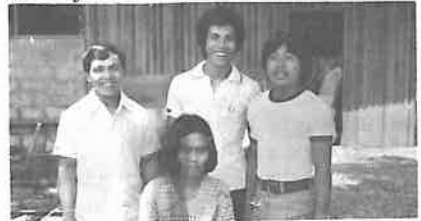
Intern students - 3rd year of school

So last year the buildings were transferred and set up about 2 miles outside of Tagum which is a main town about 28 miles orth of Davao City proper. At this time there are 30 first and second year students training in MGBI and 3 third year students on their intern