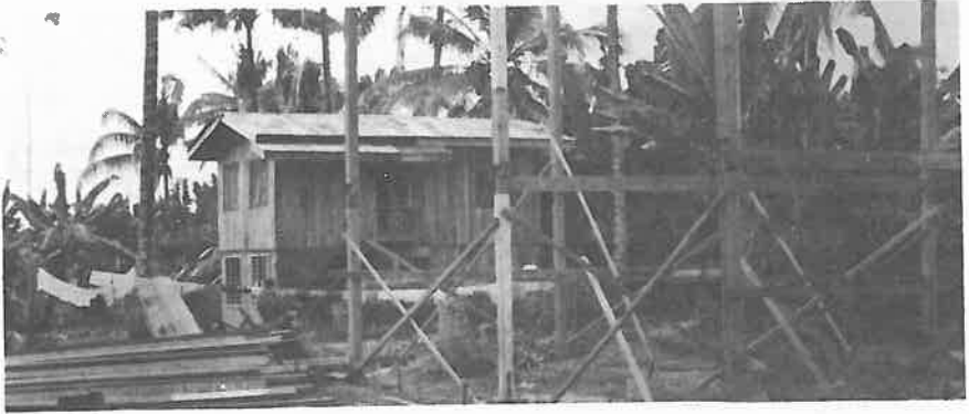
Beginning construction of the final building. It is being used now but not complete. Background--classroom, dormitory and library space.

We greet you all once again as friends of Things to Come Mission in our Saviours precious name from Davao City. As people in a leadership position (which all of us are in to a degree--parents leading children, teachers leading students, pastors leading churches, management leading industries, leaders of peer groups, etc.) we need to sit down often and figure out the best way in which to lead. We need to know where we are now, where we want to go and finally what will take us to the goal. We have heard it said that a man who aims at nothing will surely hit it. As leaders we want to be able to tell people where we want to go and how we will get there.