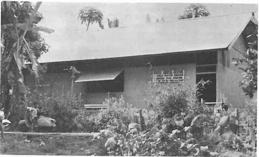
Temporary Grace Center in Indonesia Grace Bible Institute Church held here and also Men's Dormitory