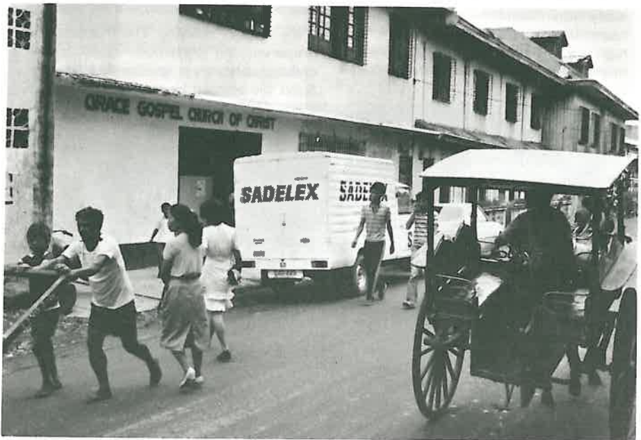
Cebu City, Philippines