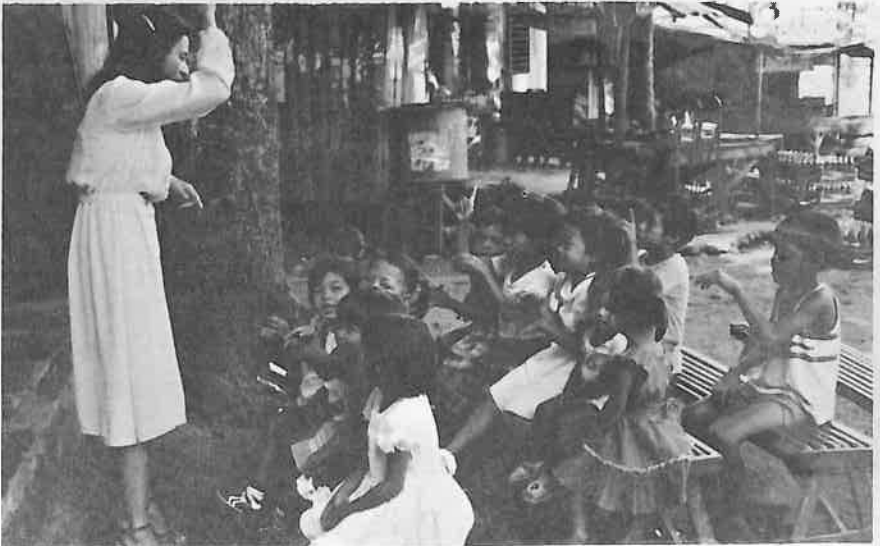
A Sunday School class at the Grace Gospel Church of Christ in Davao City

It's Sunday morning. The teachers are prepared, the classroom ready, some children preparing for Sunday School. Soon the singing begins, more children