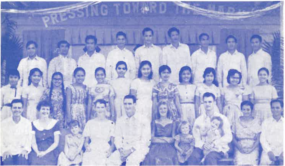
FIRST GRADUATION DAY FOR CHRIST: Picture shows the student body and faculty staff of the International Grace Bible Institute in Clarin, Misamis Occidental.