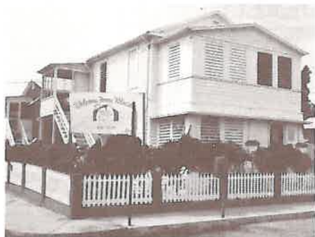
Welcome Home Ministries