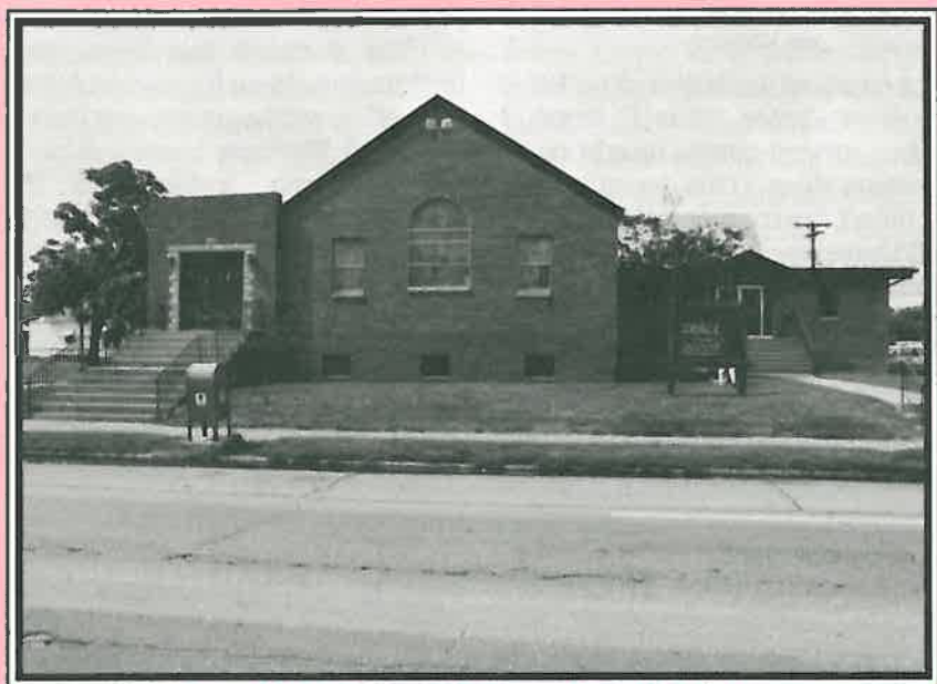
New U.S.A. Things To Come Mission Office