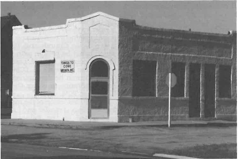
Cope, Colorado Office