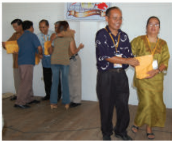
The 19 Filipino missionaries and children were honored with certificates. They also had opportunities to set up displays and to present their ministries to the conference.