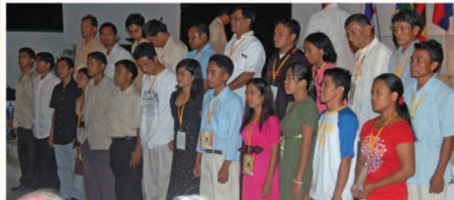
The four International Grace Bible Institute Campuses graduated 36 students this year, many of whom will become pastors and Bible women with the Grace churches.