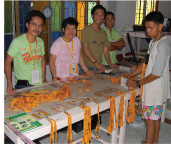
Registration was a six-step process with a photo ID

The motorcade on the day before the conference paraded with trucks, buses, vans, cars, jeeps, and motorcycles, colorful streamers and banners of various delegations; flags of participating countries proudly waved behind traffic police who escorted the spectacular activity through the city.