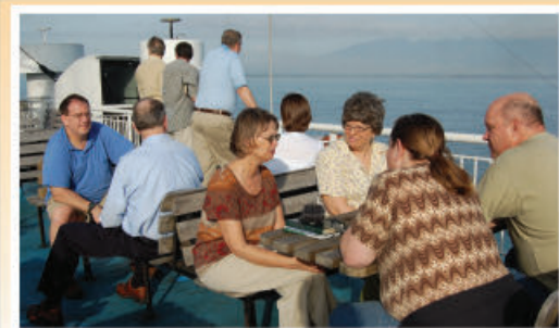
Travel in the Philippines still requires boat travel, just as in the early days. Fifteen visitors rode the overnight boat from Cebu to Ozamiz.